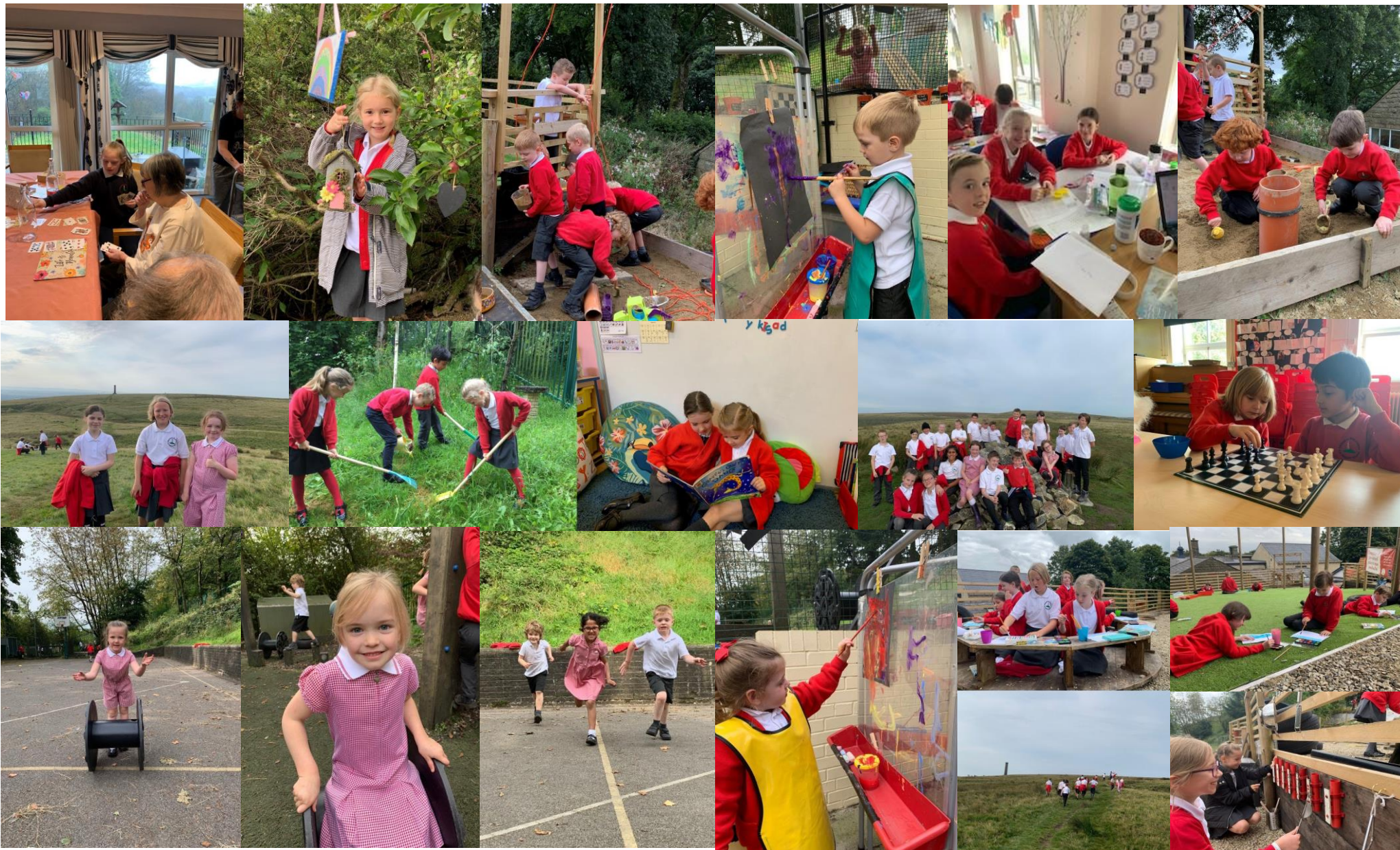
Emmanuel Holcombe Primary School, Holcombe village, Ramsbottom, BL8 4PA